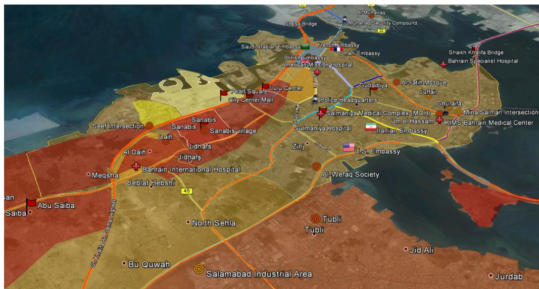
(Customized Map for Manama, Bahrain)

Click here for a sample of our Tactical Intelligence Services.